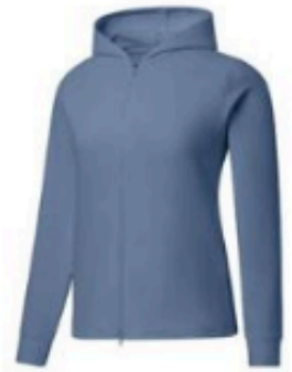
Additional Women Jacket $ 80 .00