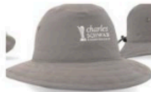
Bucket Floppy Hat $ 30 .00