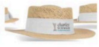
Straw Hat $ 30 .00