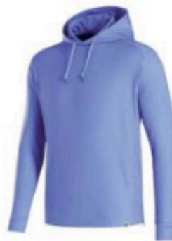
Additional Men Jacket $ 80 .00